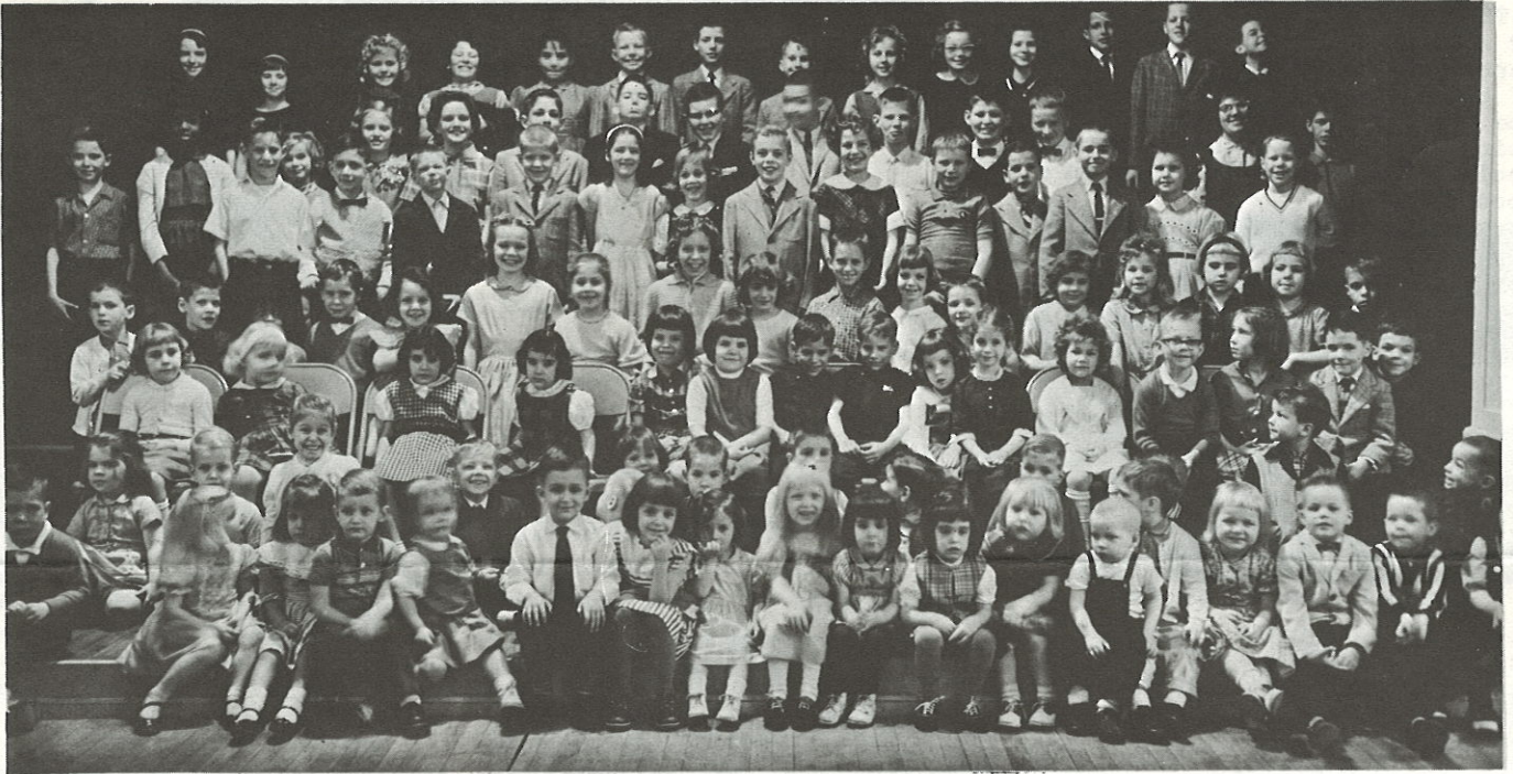
These bright, beaming faces are of the Akron children. They radiate the happiness and joy that comes from proper childrearing.