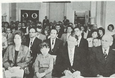
Harrisburg Bible Study

The meeting was marked by lively interest and genuine enthusiasm--everyone being thankful for this added opportunity to learn and understand more of God's Word.