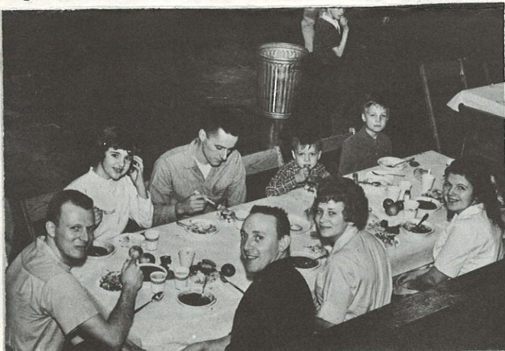
Enjoying fellowship God's way,