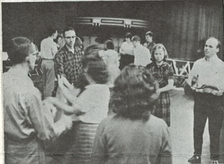
Everybody join in the fun!

THEY SAID IT COULDN'T BE DONE-- 12 sets or 96 people square dancing at one time. The people of the Pittsburgh Church did it and had the time of their lives doing it in one of the liveliest social get togethers held in a good while.