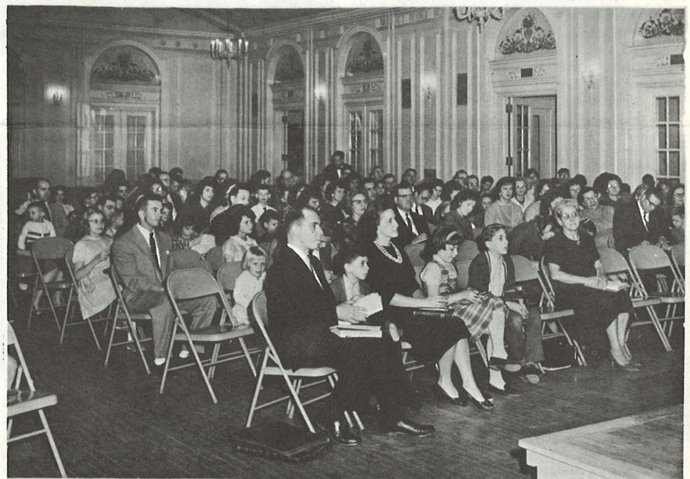
Akron Bible Study