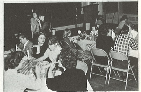
Tired skaters - wholesome fellowship - chili and beverage.