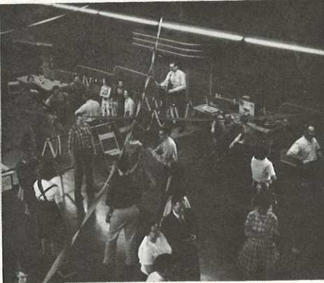
"Choose your partners, folks!"